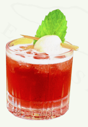
Berry Lychee Iced Tea 12.0

Triple Vanilla Bean Ice Cream served with a shot of freshly brewed Espresso