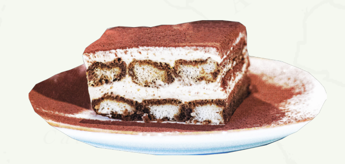
Tiramisu (A) 18.0

A Singapore Coffee Signature creation. Aromatic, creamy and absolutely delicious, our Kopi Shake is perfect for those looking for an elevated kopi drink. Pre-blended with both evaporated and condensed milk.