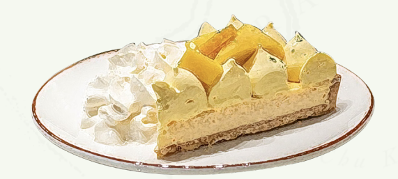
Yuzu Mango Cheesecake Tart 18.0

Refreshing with just the right amount of zest, savour our Signature Lemon Tart for a delightful end to your meal or pair it with our aromatic coffee for a mid-afternoon treat. Served with Chantilly Cream