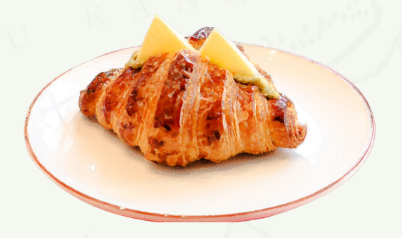
Kaya Butter Croissant 8.0

House proud Singapore Coffee Kaya (Coconut Jam) spread with Butter slices nestled within a freshly baked Butter Croissant.