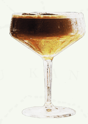
Kopi Shake<sup>TM</sup> 14.0

Experience the aromatic delight of our Pandan Latte, crafted with creamy coconut milk with fragrant pandan, a tropical leaf known for its subtle vanilla-like flavour. Available hot or Iced