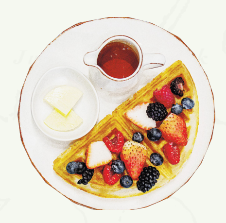
Waffle & Berries 14.0

Savour our rendition of Tiramisu with the marriage of our Gentle Conqueror coffee in this layered dessert. A Must Try! Contains alcohol.